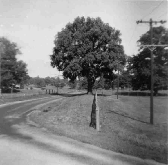
The back fence.