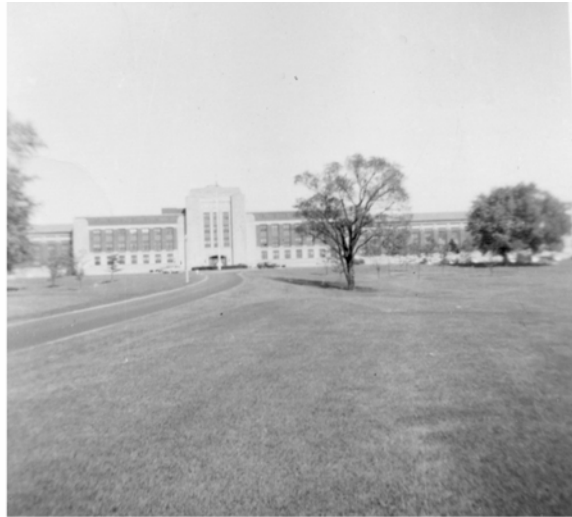
The main entrance of the prison.

On other days, I rode my bike over to the prison. The commissary in the basement was the only place at Narco to buy chewing gum, Coca Cola, ice cream bars, and magazines. It also sold the film for my Brownie camera. I took many of the pictures in this essay with that Brownie. I intended to write about Narco someday, when the cacophony of sounds and silences had resolved into harmony.