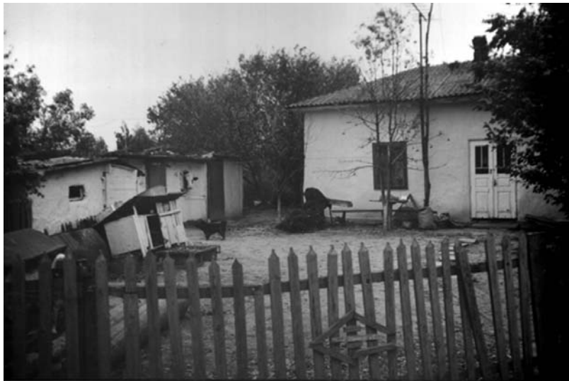
Probuzhna in 1993. Grandpa had more than one reason to run away.