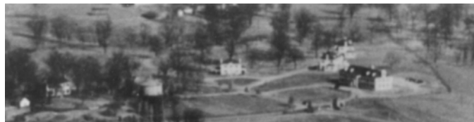
Below: the residences (detail)

Narco provided housing for the doctors on its pastoral grounds, about half a mile down the road from the prison. Two duplexes and a larger house, all whitewashed brick, looked onto the circle, a narrow road on the rim of a hollow. An apartment building for bachelor officers, also whitewashed brick, stood off to the side. The Medical Officer in Charge lived in style at the top of a nearby hill, in a white frame mansion with terraced gardens and outbuildings. The narrow red brick house perched halfway up seemed oddly out of place. We lived in a duplex at first, and later in the red brick house. It was cramped -- by the time I was nine I had two sisters and a brother -- but, in its oddity, fitting.