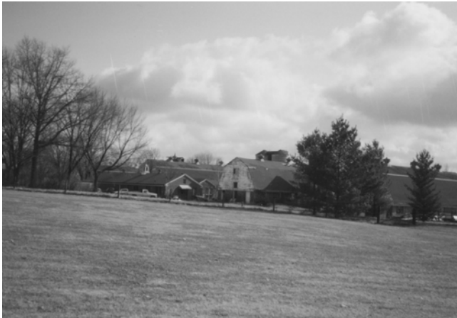
The barns at Narco, 1998.