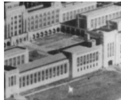
detail: the courtyard

To get to the auditorium, I had to cross the courtyard behind the prison's entrance hall. Patients thronged the yard. Some of them just looked at me with dark sad eyes. Others hooted. They hooted from the yard, from the windows, from their cells. The echoes bounced off the walls in all directions. Terrified, I ran as fast as I could and into the hall on the other side.